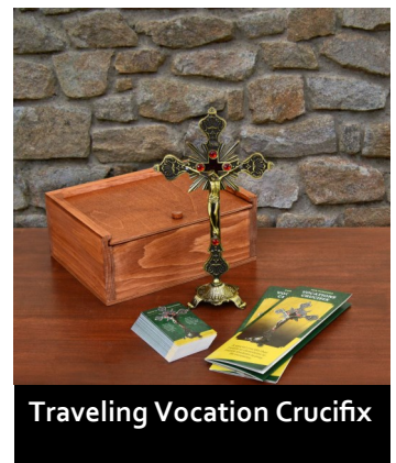
Traveling Vocation Crucifix

Since the Year of Mary in 2013, IC families have been enjoying a visit from Traveling Mary as she becomes part of their family for approximately one month.